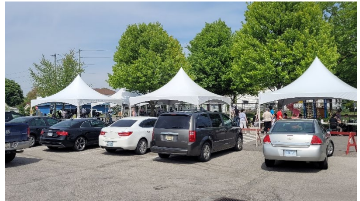
Temporary Foreign Worker pop-up clinic in Leamington

Over 5000 temporary foreign workers were vaccinated with their first dose of COVID-19 vaccine at the Nature Fresh Recreation Centre Clinics (April 28 th to May 6 th , 2021) and at the 2-day outdoor pop-up clinics (May 20 th and 21 st , 2021). Over 130 farms scheduled vaccinations for their temporary foreign workers, while also coordinating transportation, providing educational materials, and addressing vaccine confidence. These efforts are in addition to existing COVID-19 procedures that have been implemented since the onset of the pandemic.