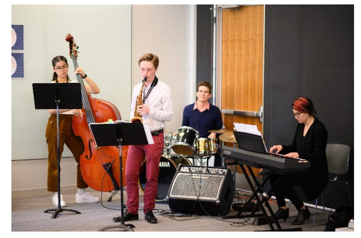
École secondaire catholique l'Essor Jazz Combo