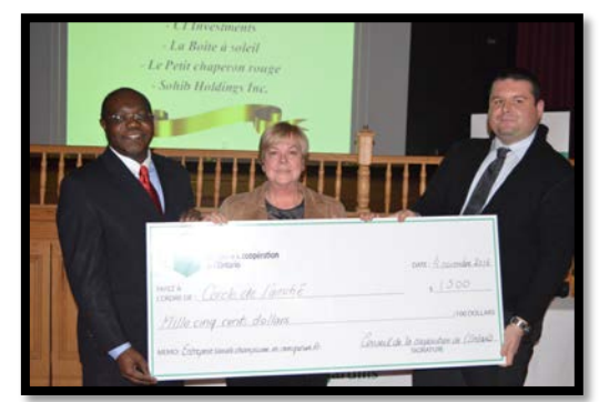
Le Cercle de l'Amitié, gagnant dans la catégorie Entreprise social / winner in the social enterprise category

The closing ceremony was held at the Marconi Club under the theme: "Francophone from five continents". Nearly 150 partners and members of the community from Central-South-West