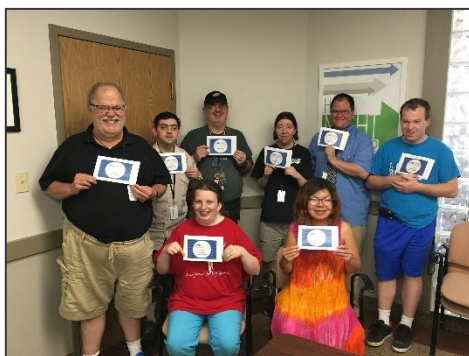
Understanding Everyone!! Accepting Equality; Understanding; Equality; Inclusive - include everyone; Teaching; Respect 4 All; Acceptance ~ Community Living Essex County - New Day, Leaders of Today members