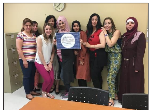
Greet all comers with compassion and empathy ~ Women's Enterprise Skills Training of Windsor Inc.