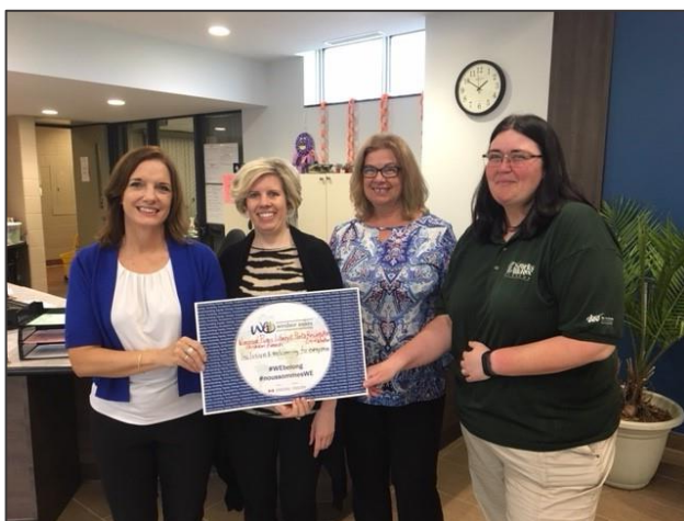
Provide inclusive and welcoming customer service to everyone ~ Windsor Public Library Chisholm Branch & Parks & Recreation Optimist Community Centre