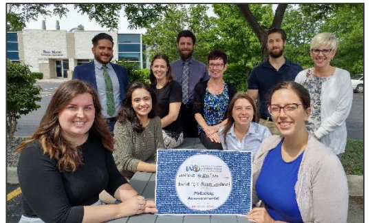
Promoting a diverse workforce ~ Workforce WindsorEssex