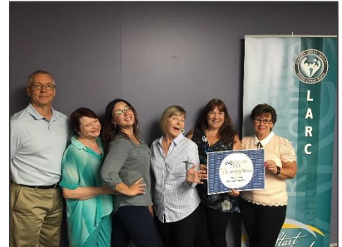
To be community ambassadors ~ GECDSEB Language Assessment Centre