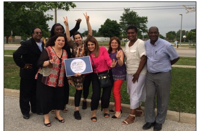
Pour une collaboration francophone et inclusive ~ Assemblée de la francophonie de l'Ontario (ACFO) Board of Directors