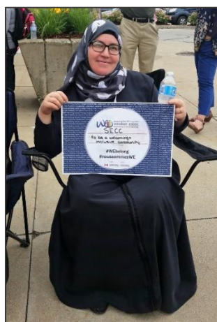
To be a welcoming and inclusive community ~ South Essex Community Council