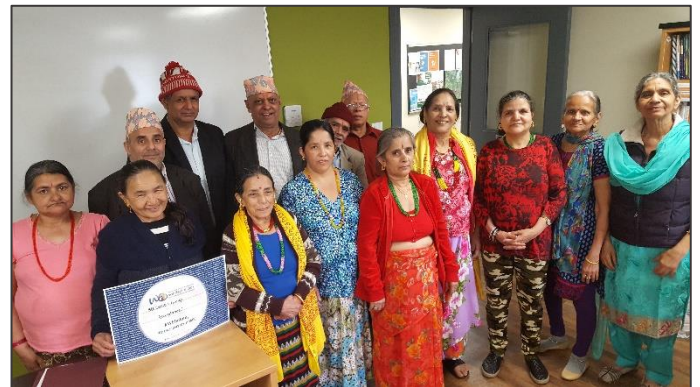
Acceptance ~ Multicultural Council of Windsor & Essex County Seniors Group