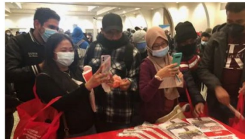
The health and information fair brought more than 20 community groups together to help migrant workers navigate life in Windsor-Essex.

CBC News · Posted: Apr 04, 2022 6:45 AM ET | Last Updated: April 4